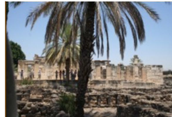
The Capernaum synagogue, as it now stands, was built in the second century AD on the foundations of the original structure which the Romans destroyed.