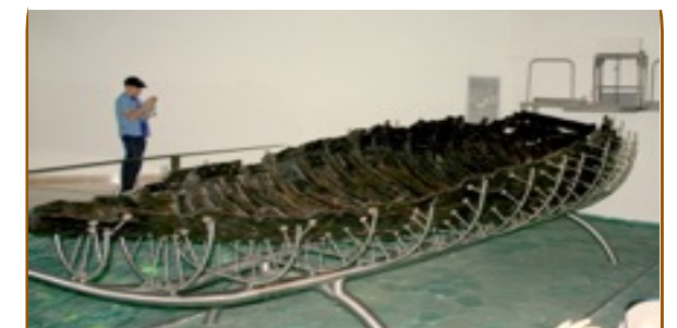
The remains of a first century fishing boat found buried and partly preserved in the silt of the lake in 1986

Use the following words: fishing, synagogue, Simon Peter, north western, farming, 1500, occupied.